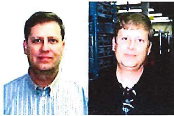
Hall – Minnesota DMV (11/2001)