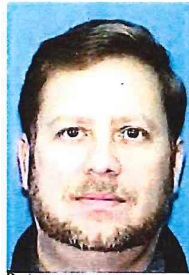
Hall – Passport (2007)