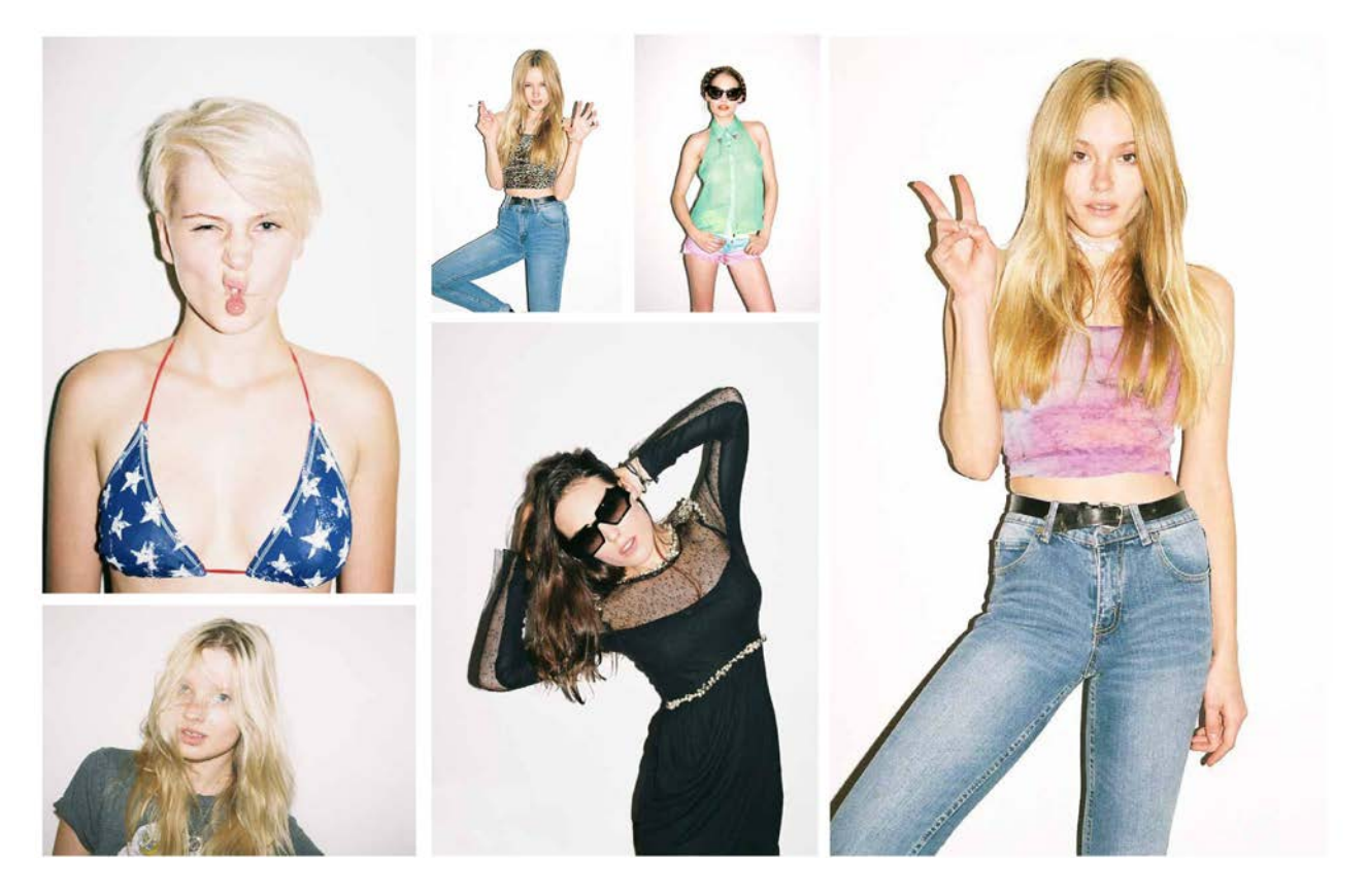
53. At the photoshoot, JUUL took photographs and videos of models posing with the JUUL e-cigarette for use in the Launch Campaign. The following is a selection of creative "assets" generated for the Vaporized Campaign using photographs from the photoshoot.